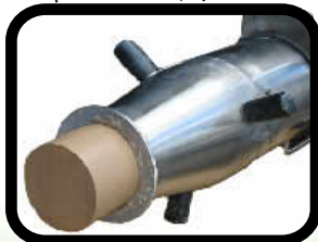
standard nozzle 80mm (3")