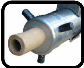
optional hollow die holder