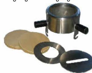
optional extruding module